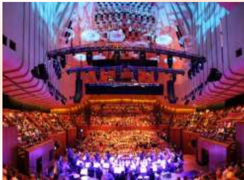
Conference Hall opera